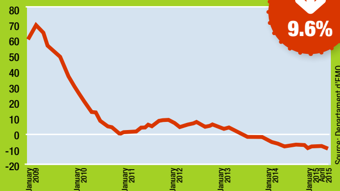
INTER-ANNUAL VARIATION OF REGISTERED UNEMPLOYMENT (IN %) FROM JANUARY 2009 TO APRIL 2015