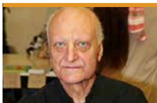
Bořek Šípek, Czech architect (1949-2016)