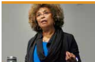
Angela Davis, African-American activist and philosopher, professor at California-Santa Cruz University, USA