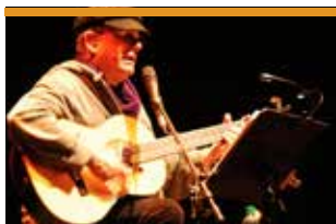
Silvio Rodríguez Domínguez, musician of the Nueva Trova Cubana