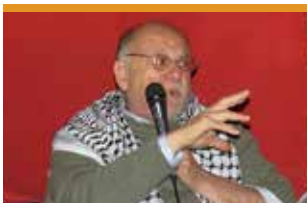
José Shulman, Argentinian writer and national secretary of the Argentinian Human Rights League