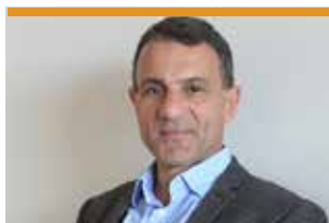
Costas Lapavistas, Former Deputy of Syriza and Professor of Economics at the University of London (School of Oriental and African Studies)