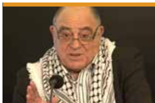
Ronald Kasrils, South African writer, former anti-apartheid activist and minister