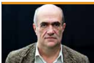
Colm Tóibín, Irish writer