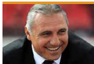
Hristo Stoitkov, former Bulgarian soccer player