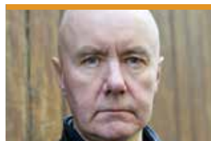
Irvine Welsh, Scottish writer