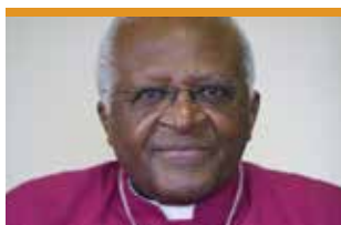
Desmond Tutu, South African archbishop and winner of the Nobel Peace Prize