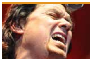
Saúl Hernández, Mexican rock star