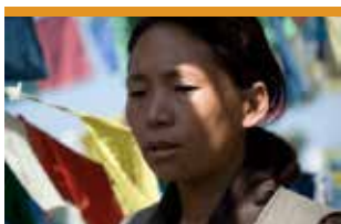
Tsering Woesser, Tibetan writer and poet