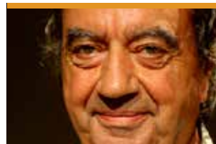
Hélder Mateus da Costa, Portuguese playwright, theatre and writer