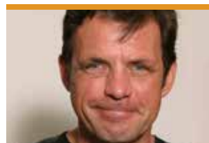
Peter Sís, American writer and illustrator, winner of the Hans Christian Andersen Award