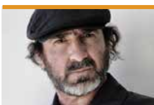
Éric Cantonà, former French soccer player and actor