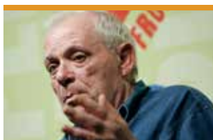
António Lobo Antunes, Portuguese writer