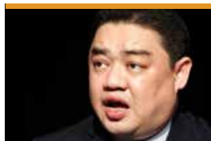
Wuer Kaixi, Chinese dissident, a leader of the student protests in Tiananmen