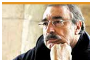
Ignacio Ramonet, journalist and former Director of Le Monde Diplomatique