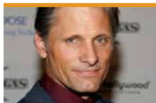
Viggo Mortensen, american actor