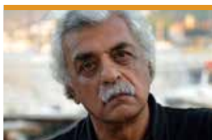
Tariq Ali, Pakistani writer and activist