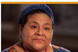
Rigoberta Menchú, leader Maya K'iche in Guatemala, UNESCO Goodwill ambassador and winner of the Nobel Peace Prize