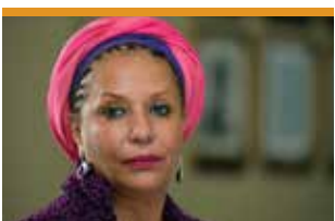
Piedad Córdoba, lawyer and politician, mediator of the humanitarian agreement between FARC and Colombia's government, leader of Colombians for Peace