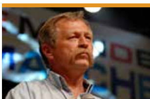
José Bové, activist of alter-globalization movement and French syndicalist, MEP for the European Greens