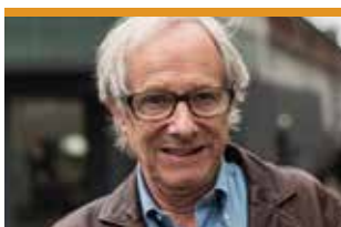
Ken Loach, English film maker