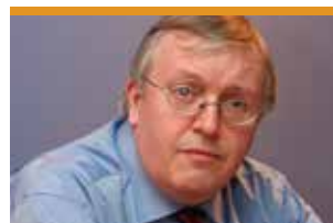
Paul Preston, English historian and Hispanist (LSE)