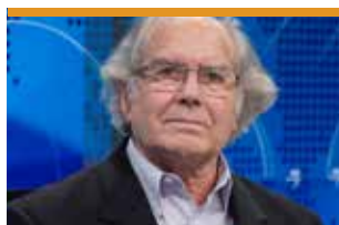
Adolfo Pérez Esquivel, Argentinean pacifist and winner of the Nobel Peace Prize