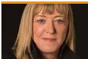
Jody Williams, american political activist for Human Rights, coordinator of the International Campaign to Ban Landmines, Peace Nobel Prize