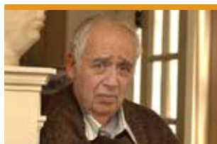
Harold Bloom, American literary critic (Yale)