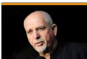
Peter Gabriel, english singer-songwriter, record producer and humanitarian