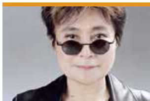
Yoko Ono Lennon, japanese artist, singer and peace activist