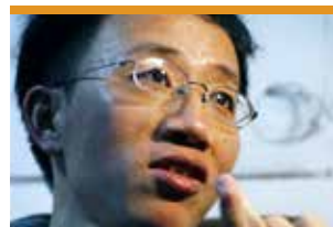
Hu Jia, winner of the European Parliament Sakharov Prize for Freedom of Thought