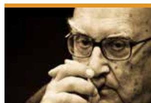
Andrea Camilleri, Italian theatre director and writer