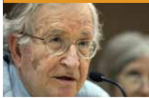
Noam Chomsky, American linguist (MIT)