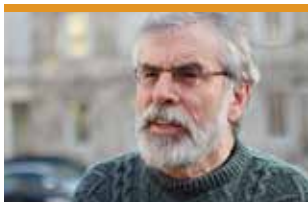
Gerry Adams, Irish politician, Sinn Féin president