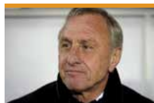
Johan Cruyff, former Dutch footballer (1947-2016)