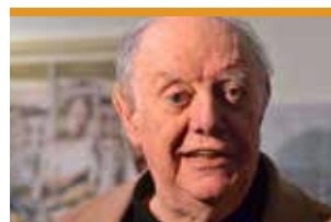
Dario Fo, Italian dramatist and winner of the Nobel Prize in Literature (1926-2016)