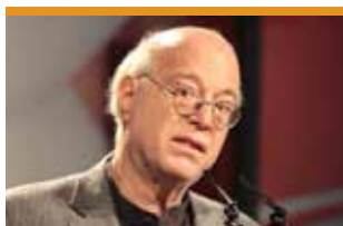
Richard Sennett, American thinker (NYU)