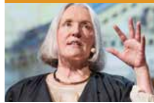
Saskia Sassen, Dutch sociologist (Columbia)