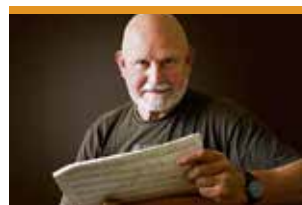
Pēteris Vasks, Latvian new age composer